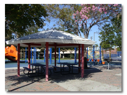
Signal Hill Park Shelter # 1

The City reserves the right to refuse use of any facility if applicant fails to comply with City rules and regulations.